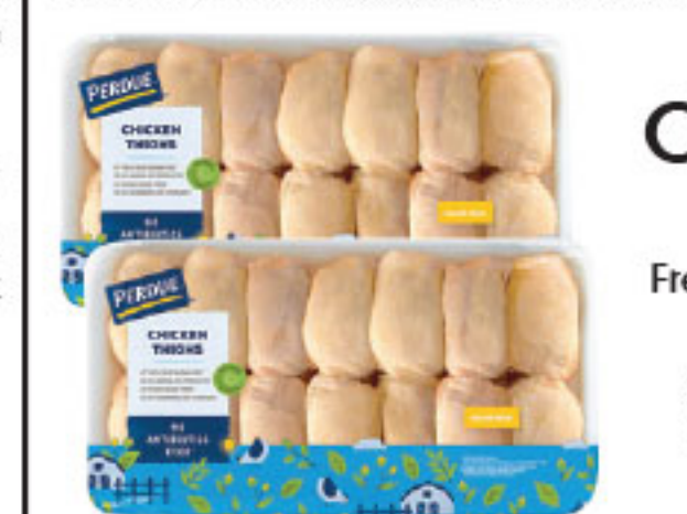
Perdue Chicken Thighs Fresh Family Pack