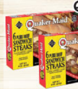
Quaker Maid Sandwich Steaks 21 Oz.