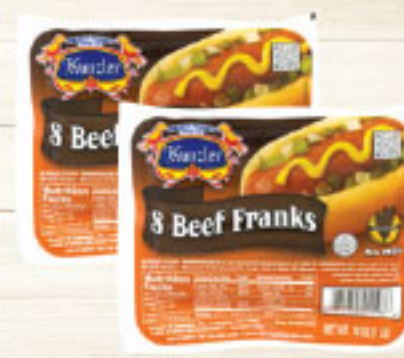
Kunzler Beef Franks 10 Oz.