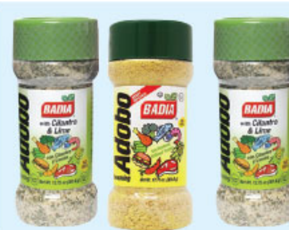
Badia Adobo Selected Varieties 12.75 Oz.