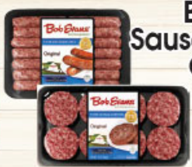
Bob Evan's Sausage, Links OR Patties Selected Varieties 12 Oz.