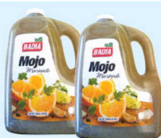
Badia Mojo Marinade 128 Fl. Oz.