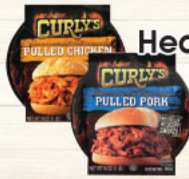
Curly's Heat & Serve BBQ Selected Varieties 10 Oz.