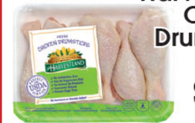
Harvestland Organic Drumsticks Fresh