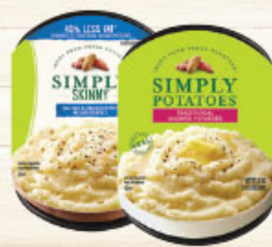
Simply Mashed Potatoes Selected Varieties 24 Oz.