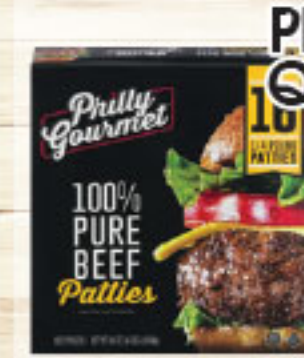
Philly Gourmet Quarter Pound Beef Patties 64 Oz.