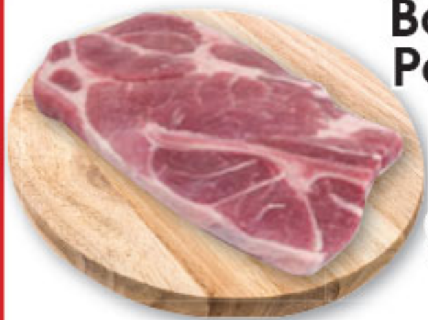
Boneless Pork Butt Steaks Fresh