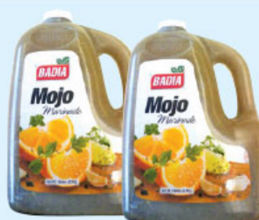
Badia Mojo Marinade 128 Fl. Oz.