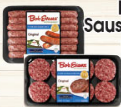
Bob Evan's Sausage, Links OR Patties Selected Varieties 12 Oz.