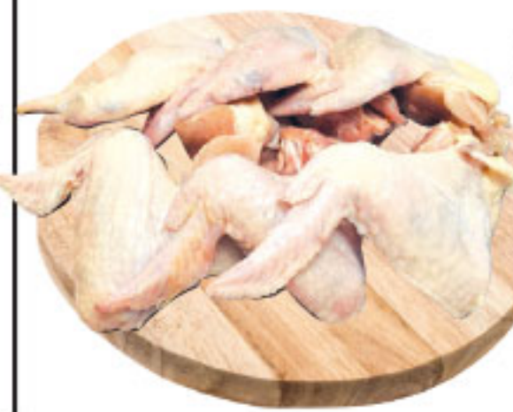
Grade A Chicken Wings Fresh Family Pack