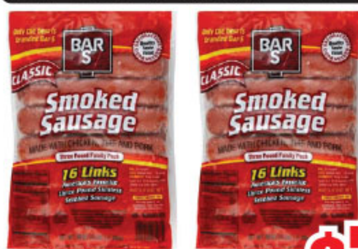
Bar S Smoked Sausage 2.5 lb.