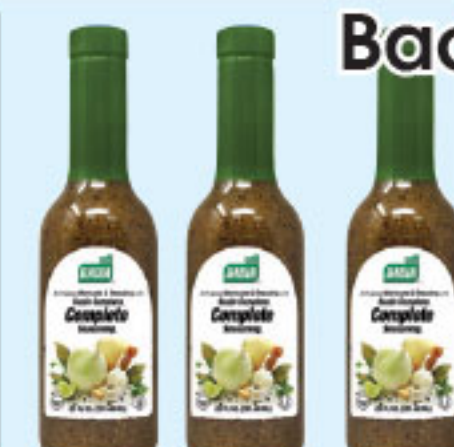
Badia Marinade Complete Seasoning 20 Fl. Oz.