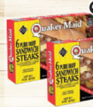
Quaker Maid Sandwich Steaks 21 Oz.