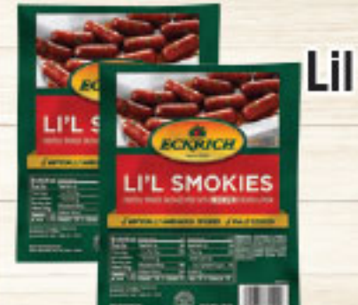
Eckrich Lil Smokies Selected Varieties 10-14 Oz.