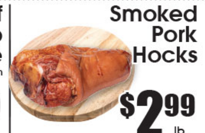
Smoked Pork Hocks