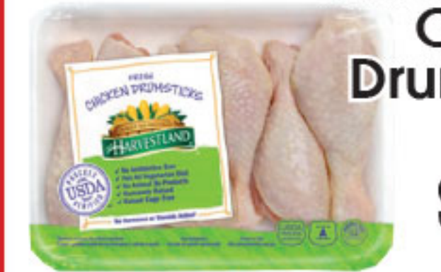
Harvestland Organic Drumsticks Fresh