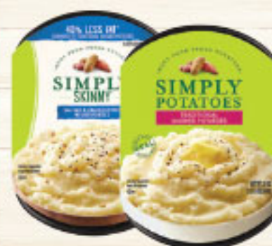
Simply Mashed Potatoes Selected Varieties 24 Oz.