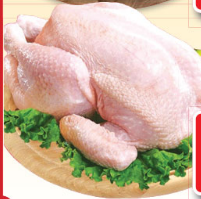
Grade "A" Whole Chicken Fresh