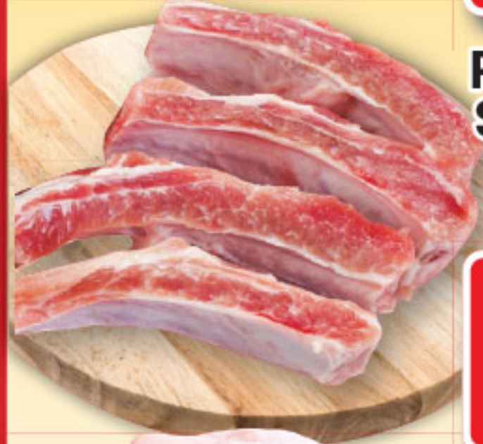
Pork Sliced Spare Ribs Fresh Family Pack