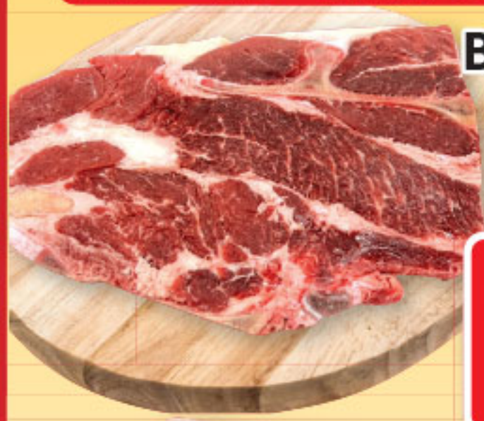
Beef Chuck First Cut Steak Fresh