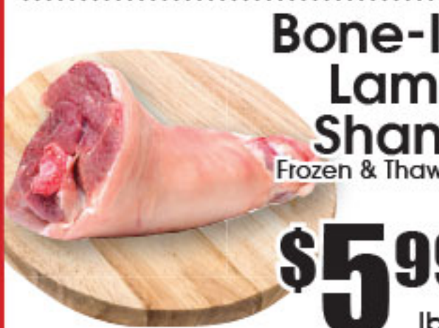
Bone-In Lamb Shank Frozen & Thawed