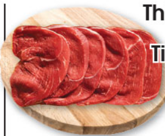
Thin Sliced Sirloin Tip Steaks Fresh