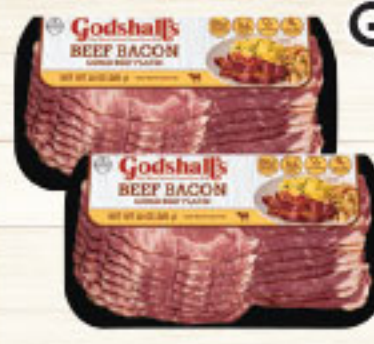
Godshall's Beef Bacon 10 Oz.