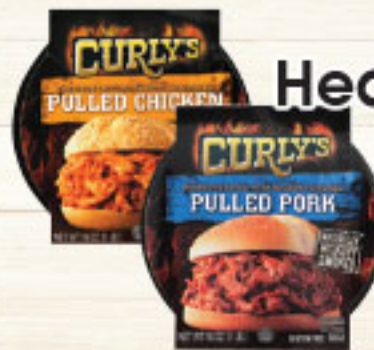
Curly's Heat & Serve BBQ Selected Varieties 10 Oz.