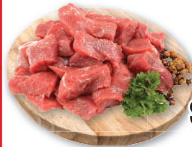
Beef Round Cubes Fresh Family Pack