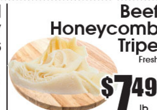
Beef Honeycomb Tripe Fresh