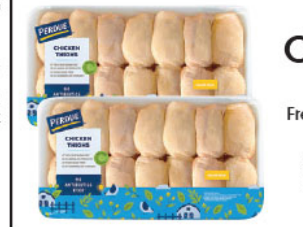
Perdue Chicken Thighs Fresh Family Pack