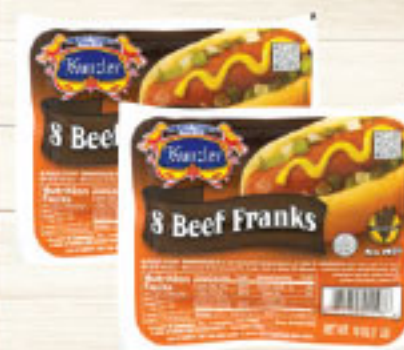
Kunzler Beef Franks 10 Oz.