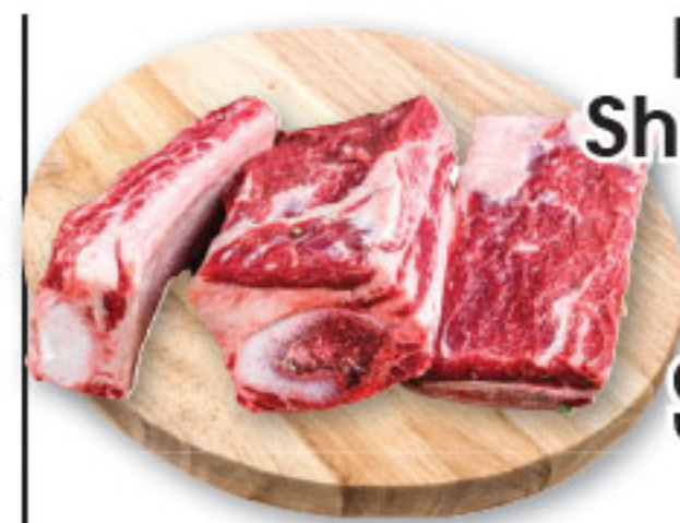
Bone In Short Ribs Fresh Jumbo Pack