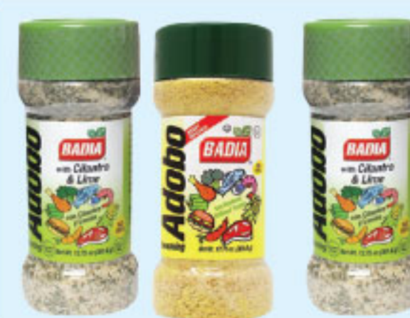
Badia Adobo Selected Varieties 12.75 Oz.