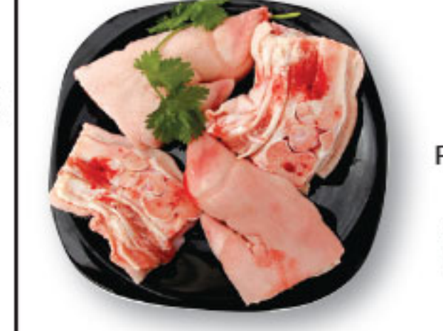
Cut Up Pig's Feet Frozen & Thawed