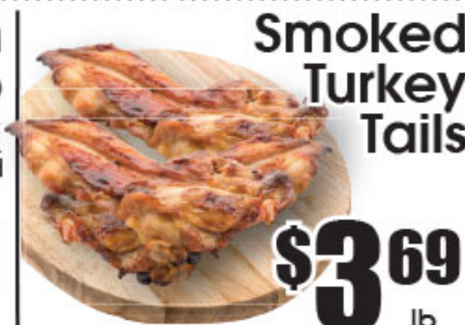
Smoked Turkey Tails