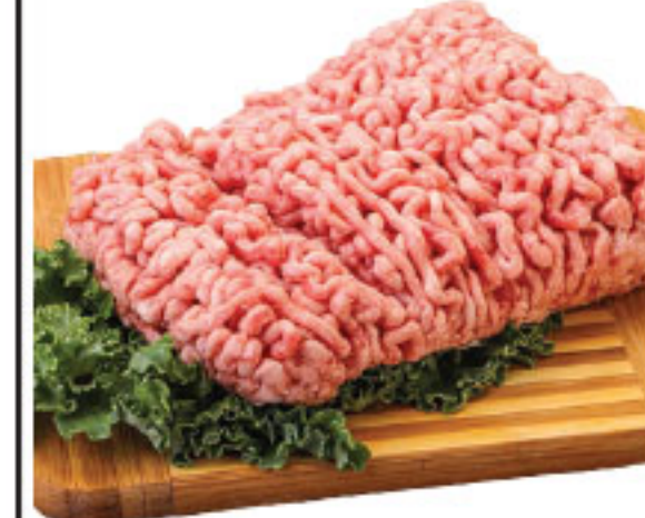
Ground Pork Fresh