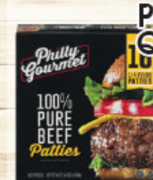
Philly Gourmet Quarter Pound Beef Patties 64 Oz.